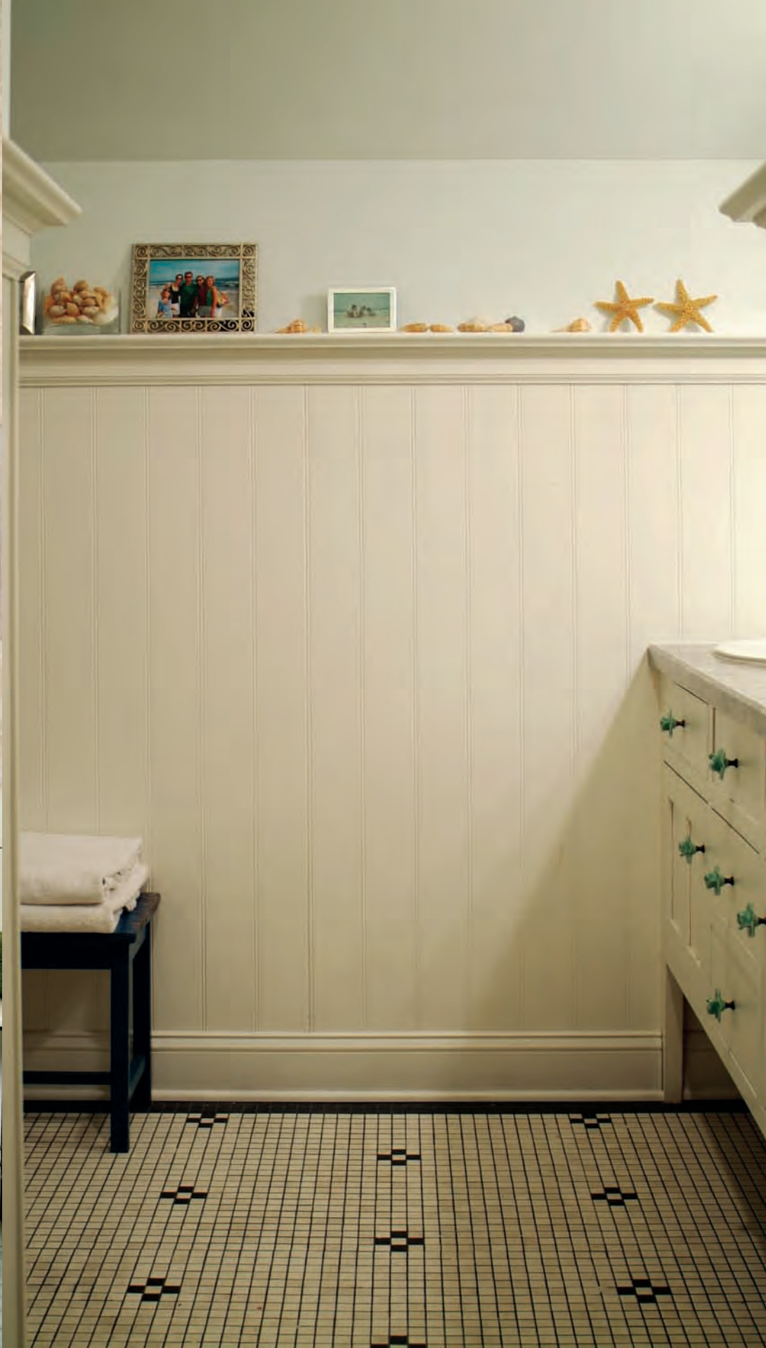
The American Pacific view of paneling includes a 4" Beadboard shown at left, Cottage Board and Batten Panels as a Wainscot and Ivory Elements Designer Panel on top in the center and 4" Beadboard with Moldings and Shelf on right. Visit americanpac.com for a more information.